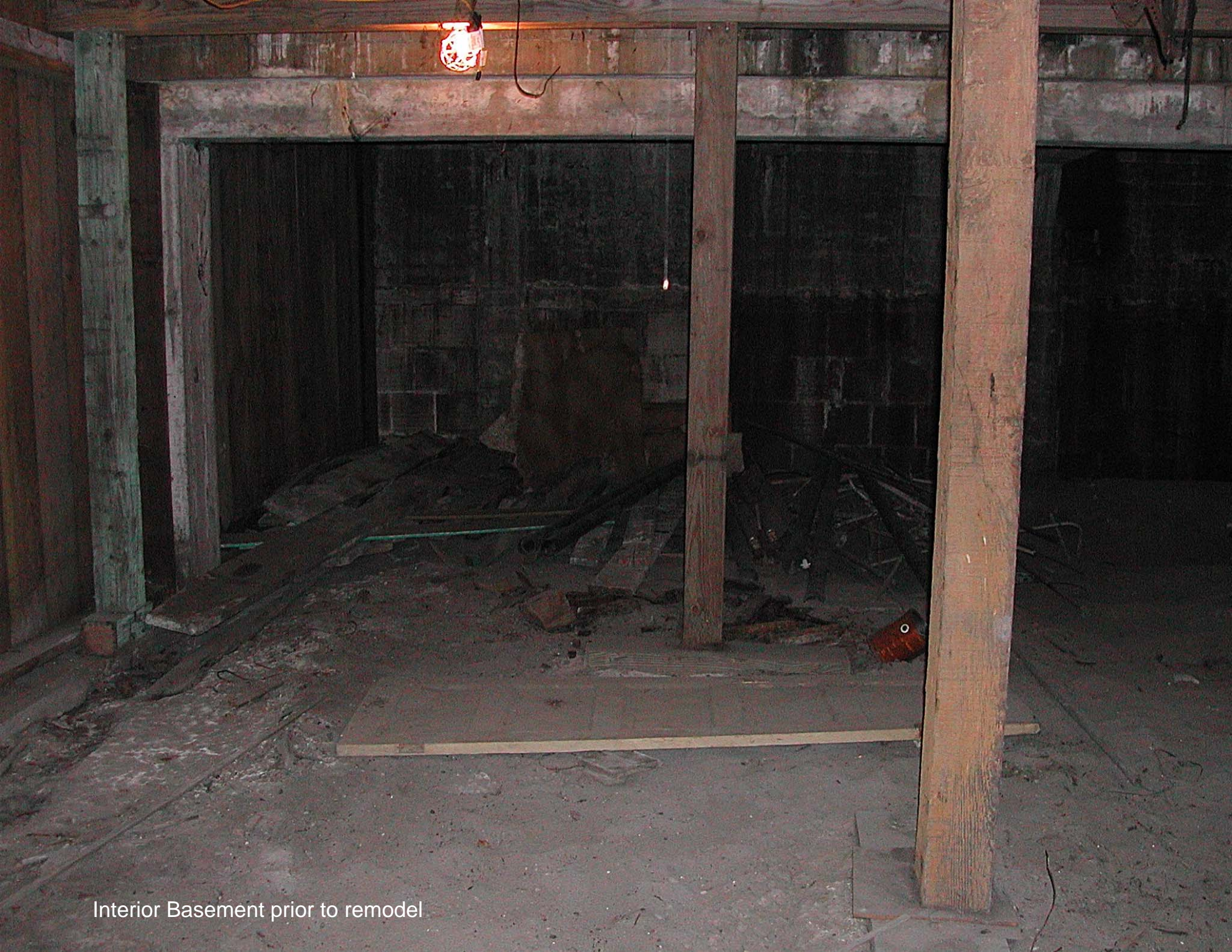
Interior Basement prior to remodel